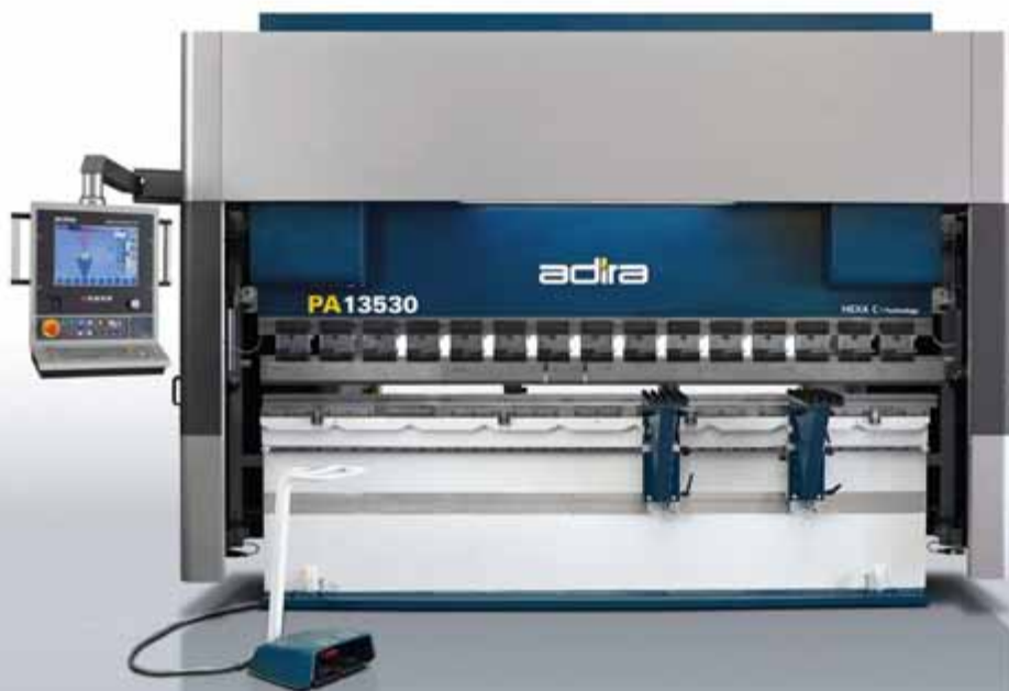
Fast | Flexible | Accurate | Sustainable PA 13530 HEXA C®