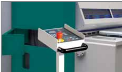
Movable control station with integrated CN

All data are approximate. Specifications are subject to changes without notice. Shown specifications may vary from country to country. For different configurations consult your Adira specialist.