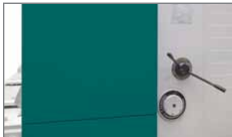
Blade clearance adjustment